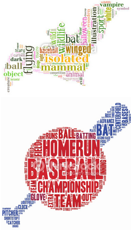
Figure 2. Illustrative contextual word clusters associated with the word “bat”

seemingly separated quantum systems behave as one, and contextual meaning can be correctly understood. [29][31]